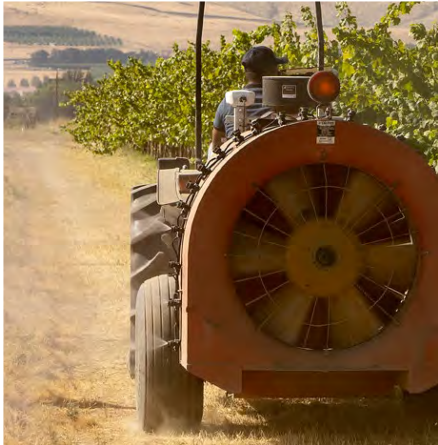
From October 2022 issue: An airblast sprayer demonstration at Washington State University's Prosser research vineyard.

- Mouse & Vole Bait (Zinc Phosphide on Oats)