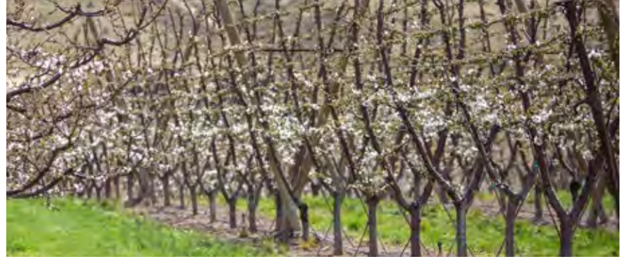
From May 15, 2023 issue: A trellised row of Early Robin cherries bloom in April near Benton City, Washington.

Campagnola pneumatic and electronic pruning systems, shears, loppers, chain saws, gas and PTO compressors. Lowe anvil pruning shears and loppers, made in Germany since 1923.