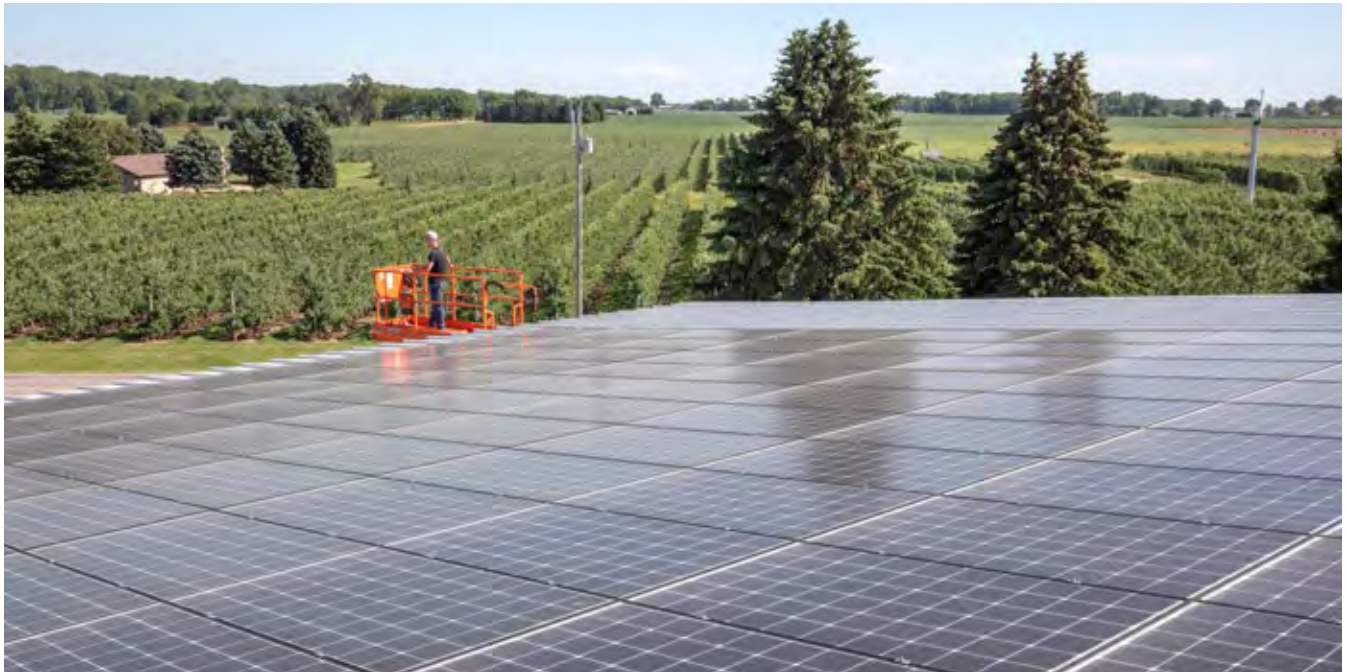
From March 15, 2023 issue: A solar panel installation on a CA storage facility in Deerfield, Michigan.

Customizable Spray Records Management Software simplifies the spray process and insurance/regulatory audits with an easy-to-use design.