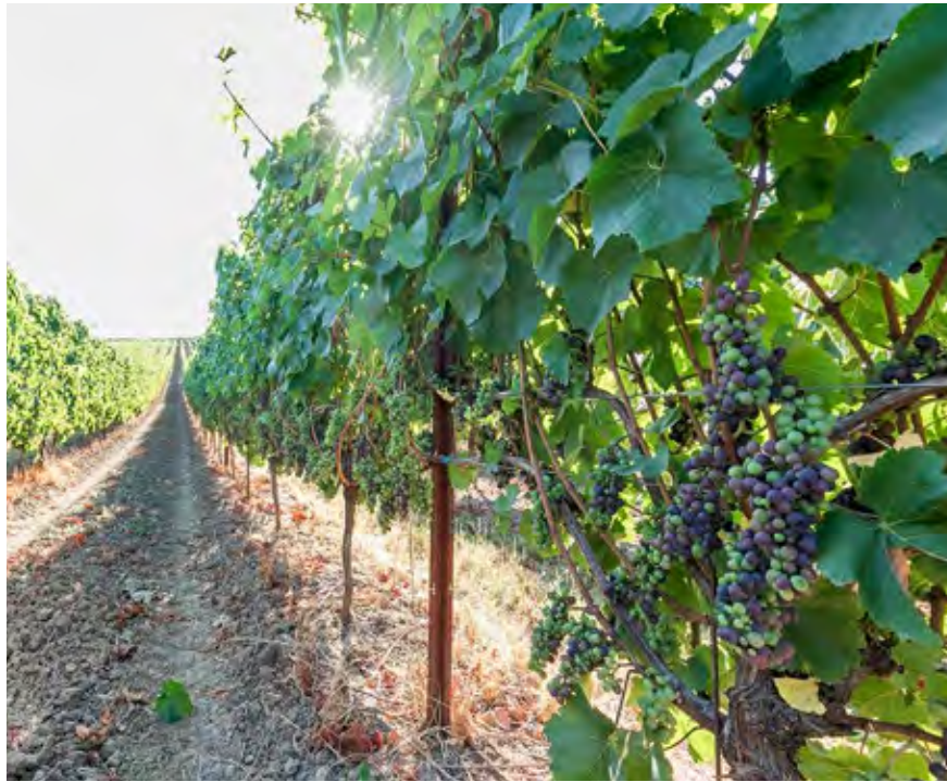
From May 1, 2023 issue: A high-yield vineyard system in Oregon's Willamette Valley.

Diamond K Gypsum is the industry leader in solution grade gypsum, sulfate of potash and other key specialty crop nutrients.