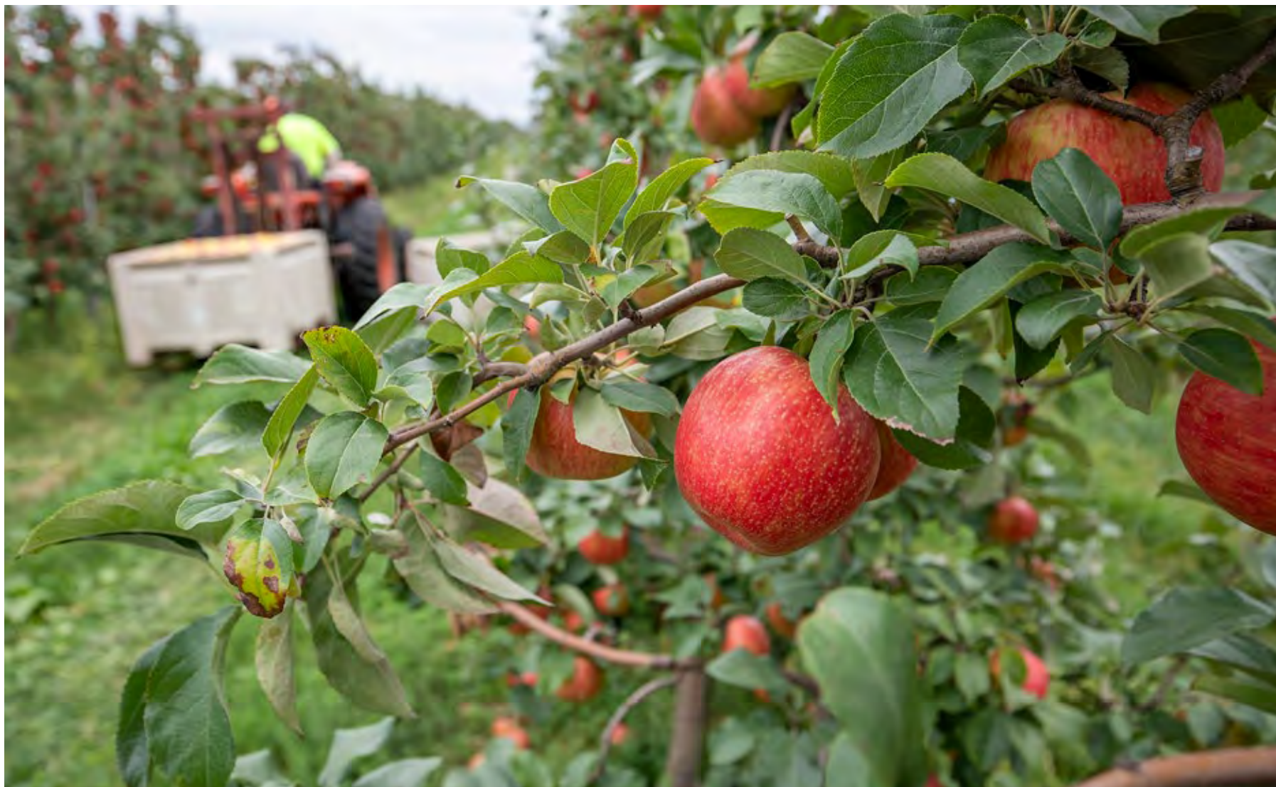
From October 2022 issue: Honeycrisp nearing harvest at Ridgetop Orchards in Fishertown, Pennsylvania.