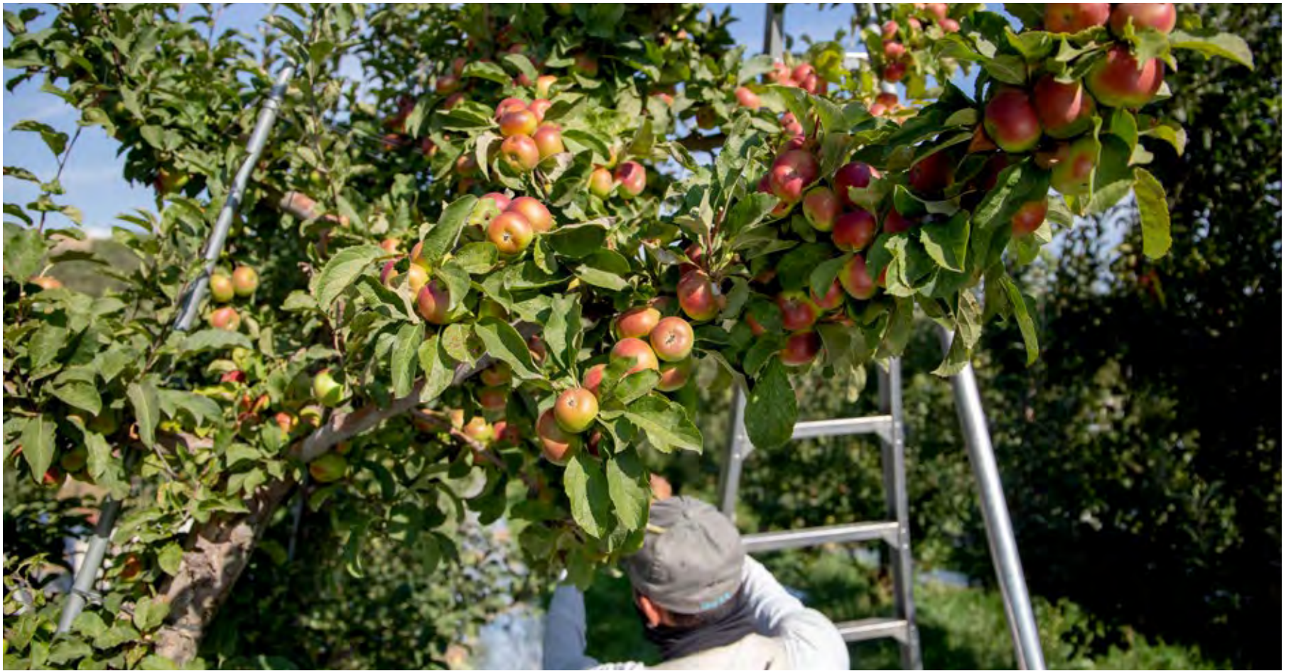
From March 1, 2023 issue: Harvesting Lady Apples in Washington's Yakima Valley.