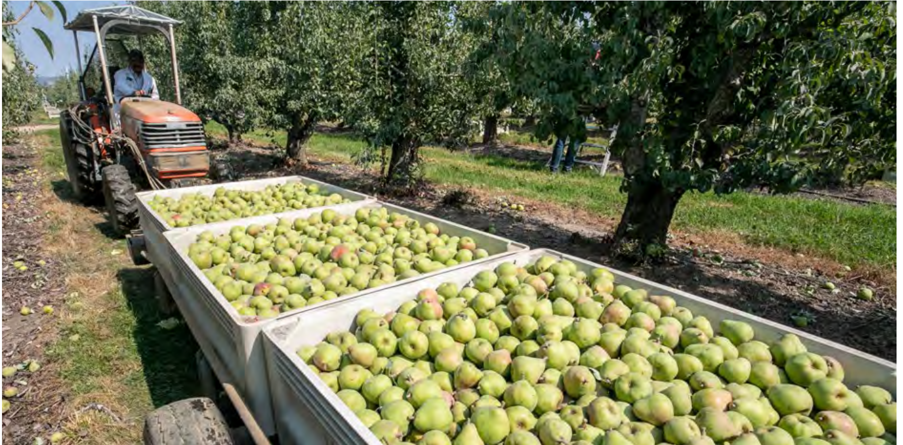
From February 15, 2023 issue: Freshly picked Comice pears in an orchard north of Medford, Oregon.