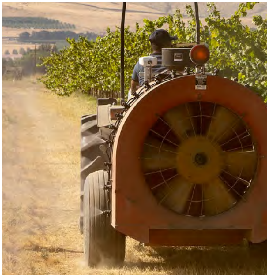
From October 2022 issue: An airblast sprayer demonstration at Washington State University's Prosser research vineyard.

- Mouse & Vole Bait (Zinc Phosphide on Oats)