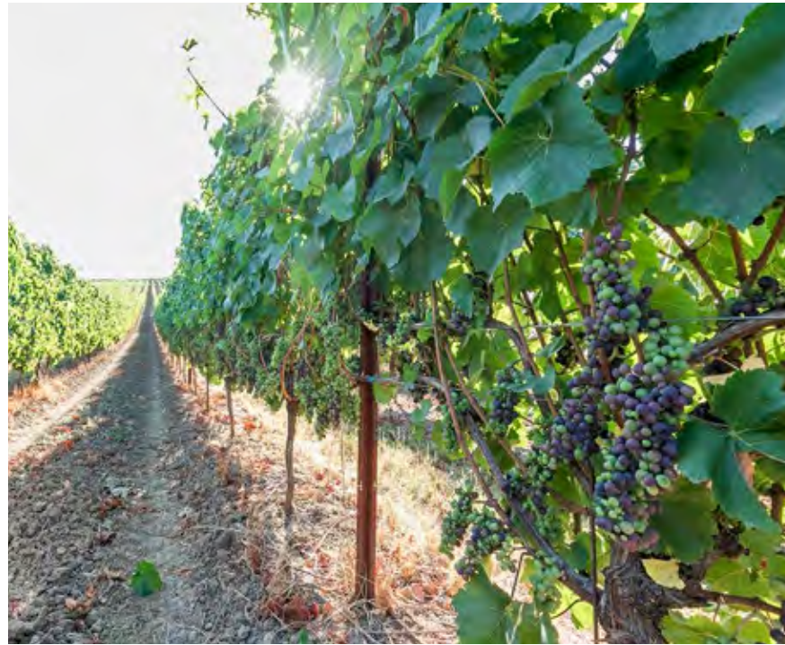
From May 1, 2023 issue: A high-yield vineyard system in Oregon's Willamette Valley.

Diamond K Gypsum is the industry leader in solution grade gypsum, sulfate of potash and other key specialty crop nutrients.