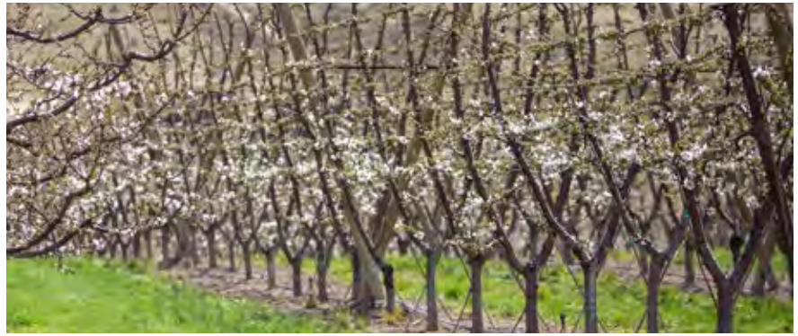
From May 15, 2023 issue: A trellised row of Early Robin cherries bloom in April near Benton City, Washington.

Campagnola pneumatic and electronic pruning systems, shears, loppers, chain saws, gas and PTO compressors. Lowe anvil pruning shears and loppers, made in Germany since 1923.